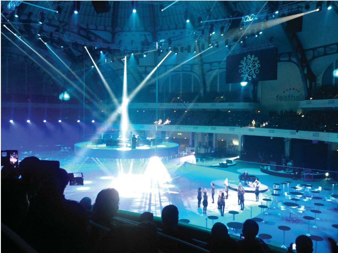
Copyright 2016 Japanese Standards Association. All Rights Reserved.